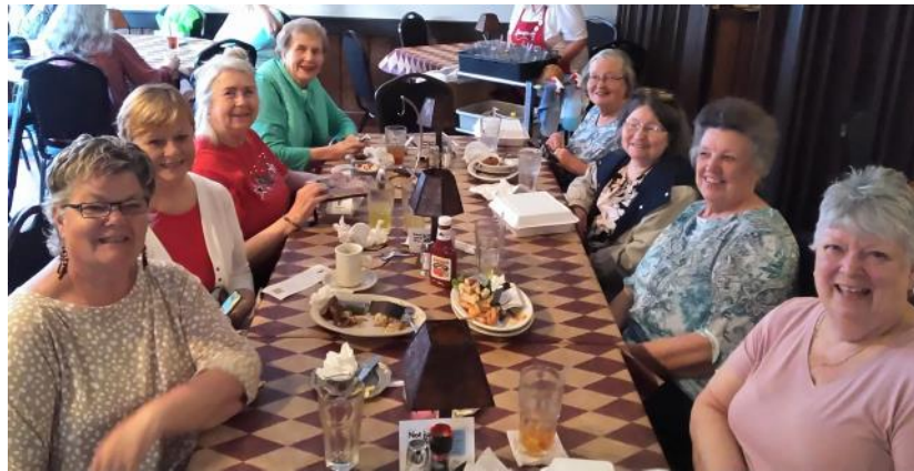
Members of the Travel Group enjoyed a trip to Jasper, IN in April.